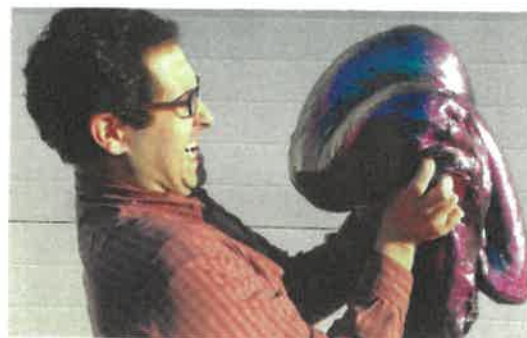
Crazy Aaron's Thinking Putty