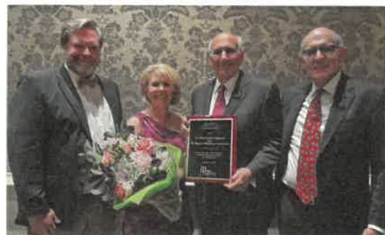
Annual Golf Inventational