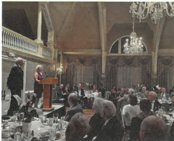
Wayne Presbyterian Community