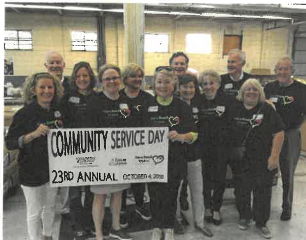
Berkshire Hathaway Fox Roach Realtors