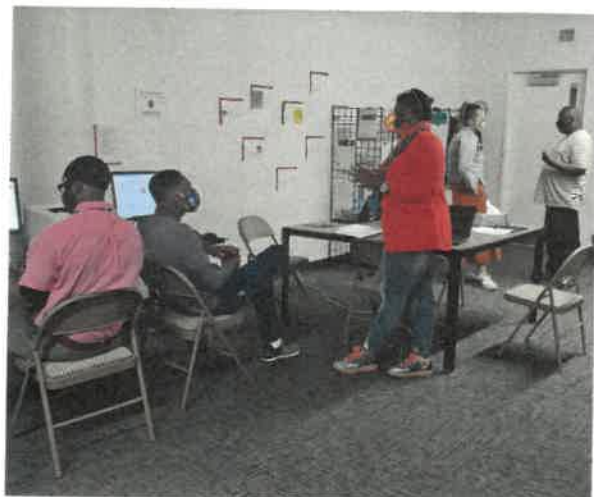
Job Readiness Training